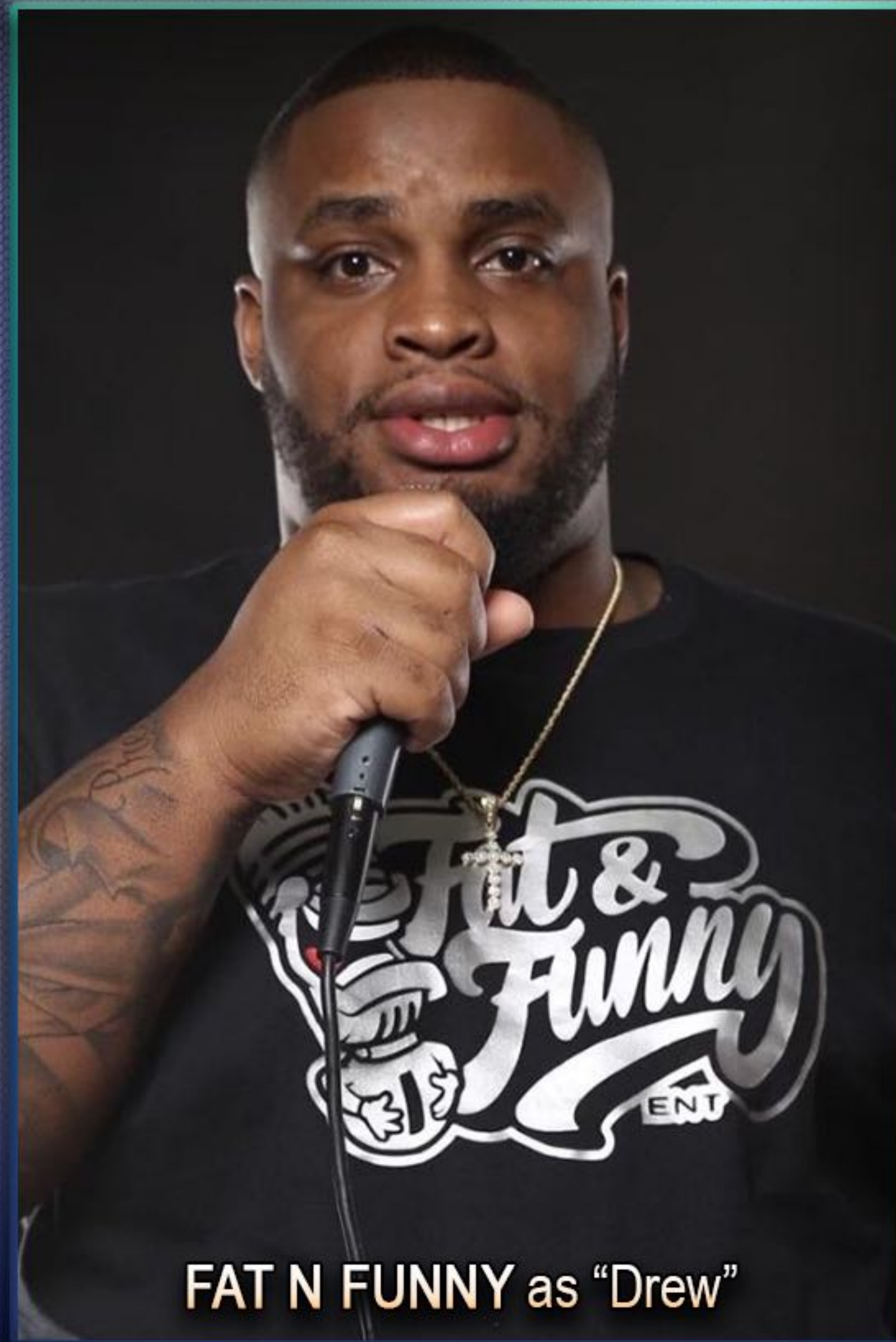
FAT N FUNNY as "Drew"